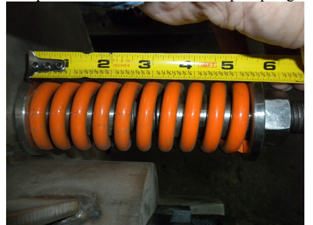
Spring Tightened to 5-3/8"

The photos below show some sample spring measurements.