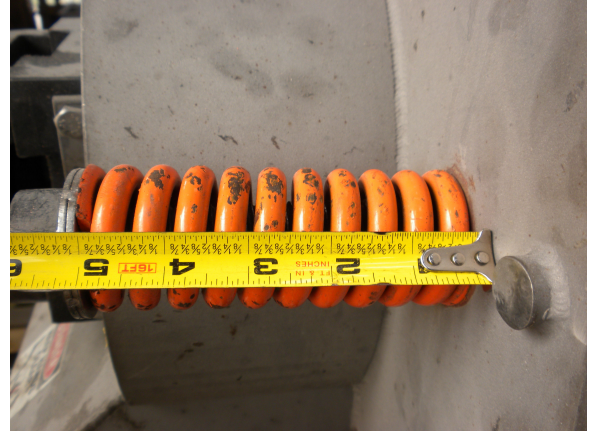
Spring Tightened to 5-1/16"